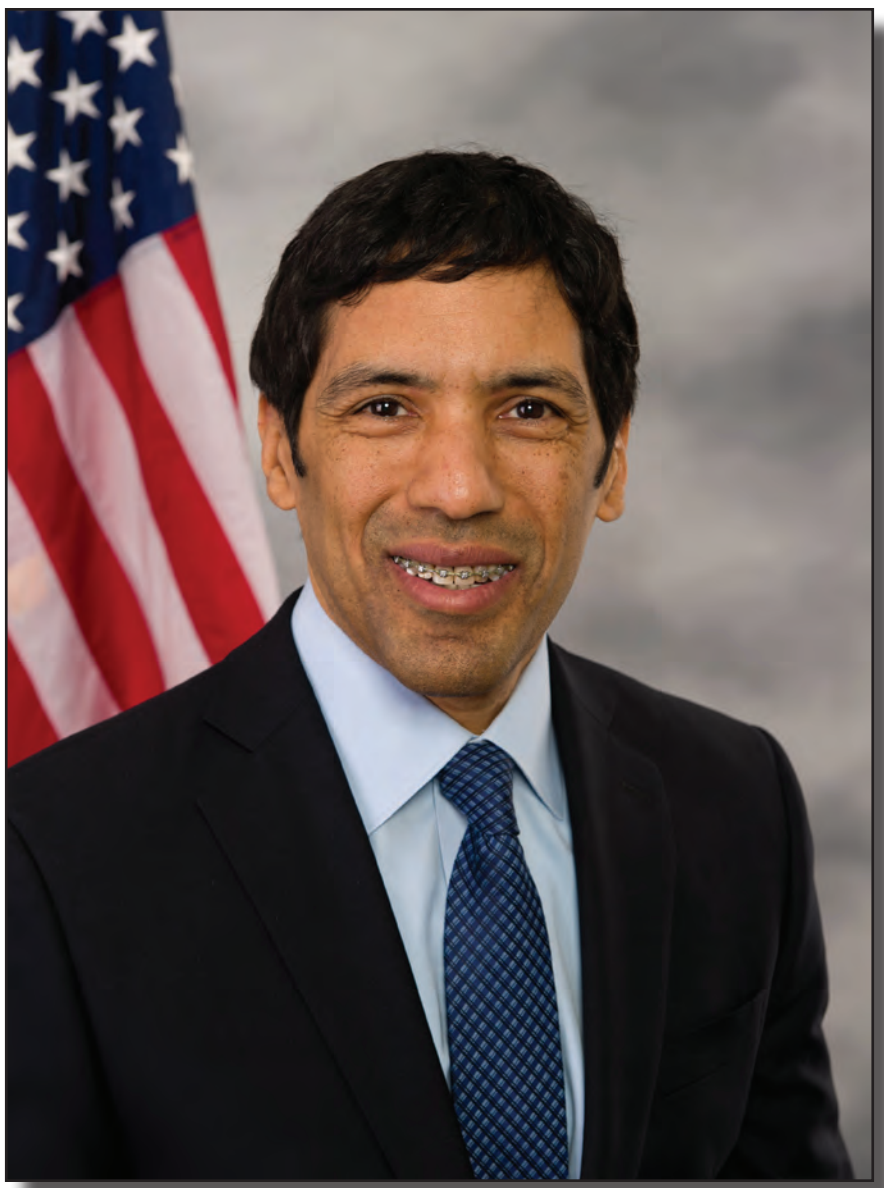
CONGRESSMAN HANSEN CLARKE

The Thomas M. Cooley Law School Center for Ethics, Service, and Professionalism, Alpha Phi Alpha Inc. Fraternity and Edge For Excellence invite you to attend an “Integrity in Our Communities” speaker series: